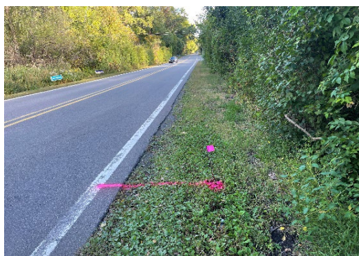
Sign installation location marked with pink paint and flag