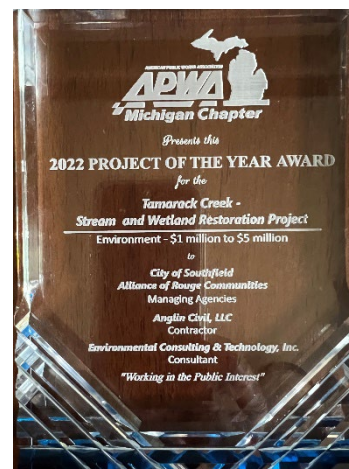
APWA Tamarack Creek project award