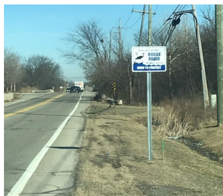
New watershed sign installed in Canton