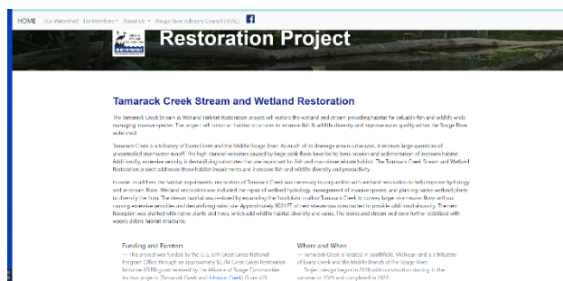
Dedicated website pages for ARC restoration projects

ARC Staff continued adding additional information and content to the ARC’s website at www.allianceofrougecommunities.com , providing more information for the general public on what they can do to help protect water quality and promotes the ARC’s restoration activities in the watershed. The website continues to provide ARC members valuable information to assist with meeting their stormwater permits while providing educational information on the Rouge River Watershed. In 2022 ARC Staff focused on developing individual pages for each of the ARC’s grant-funded restoration projects. The ARC website was moved from one hosting company to another in 2022 so unfortunately the visitor statistics are either not available or incomplete and will not be reported this year. It is assumed that with the addition of many new pages there was an increase in visitors in 2022 from the 3,679 visitors in 2021.