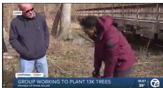
ARC Staff interviewed as part of WXYZ coverage of the ARC's GLRI Lower Rouge habitat restoration project