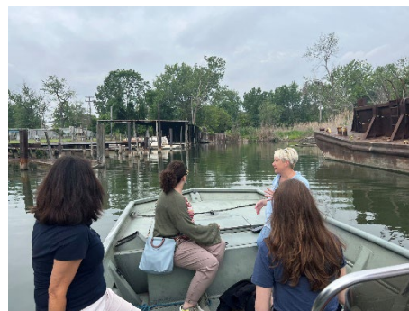
EPA/EGLE tour of restoration projects