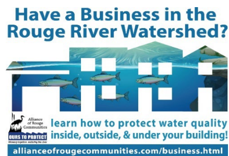
Ad graphic created in 2022 for businesses in the Rouge River watershed.